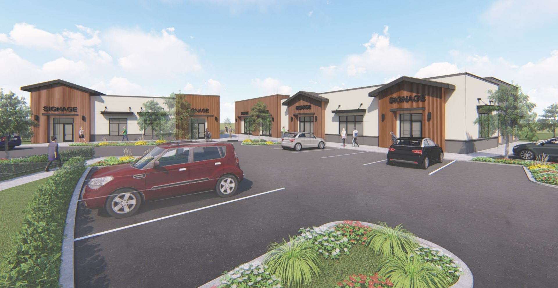
Rendering of Building K (left) and Building J (Right)